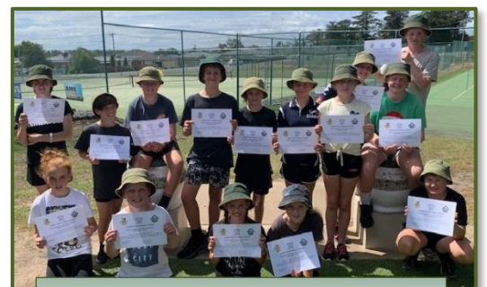
House Captains & Vice-Captains

in previous years. We have a Junior School Council which is elected at the start of each year, comprising two students (a boy and a girl) elected from Grade 3 upwards. House Captains and Vice Captains are elected at the start of each year from our Grade 6 students. Students on JSC along with House/Vice Captains undertake a leadership camp to prepare them for their roles throughout the year.