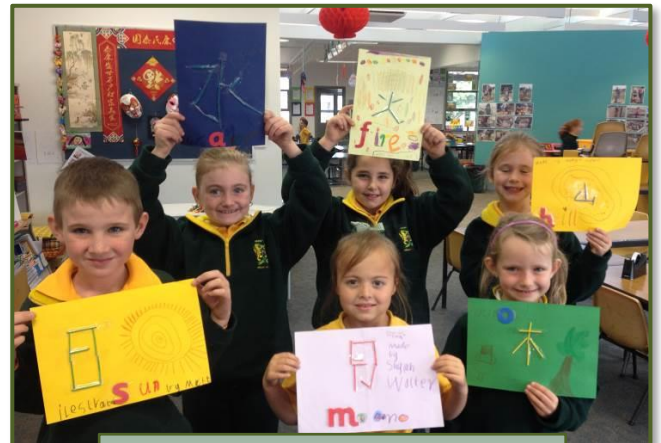
LOTE Enhancing language skills and building cultural awareness