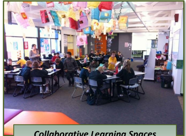
Collaborative Learning Spaces Creating powerful learning communities