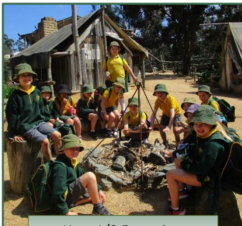
Year 1/2 Excursion