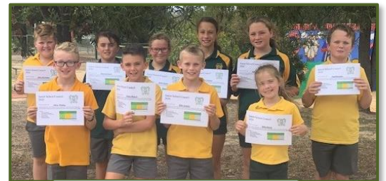
Junior School Council

Parent/Teacher communication is welcomed and strongly encouraged as we work together as a team to provide every opportunity for our children. Prior appointments are preferred as it provides everyone with the opportunity to plan in advance and make the communication more valuable. We currently have opportunity for formal interviews during the school year (see Assessment and Reporting). Parents are able to access updates from teachers via email.