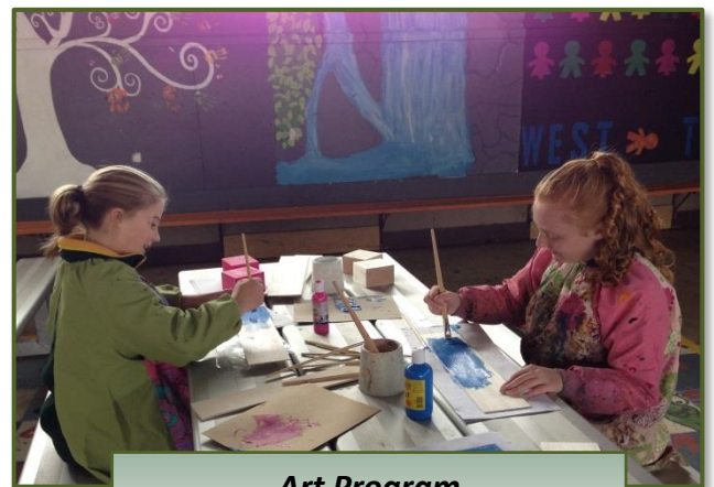
Art Program Unearthing the inner creativity