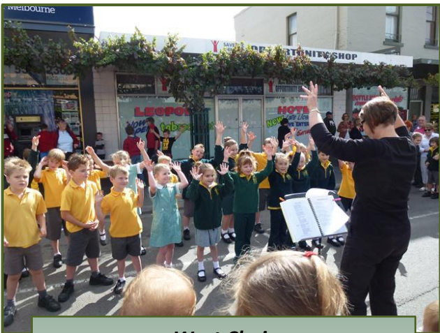
West Choir Establishing social confidence through performing arts and engaging with the community