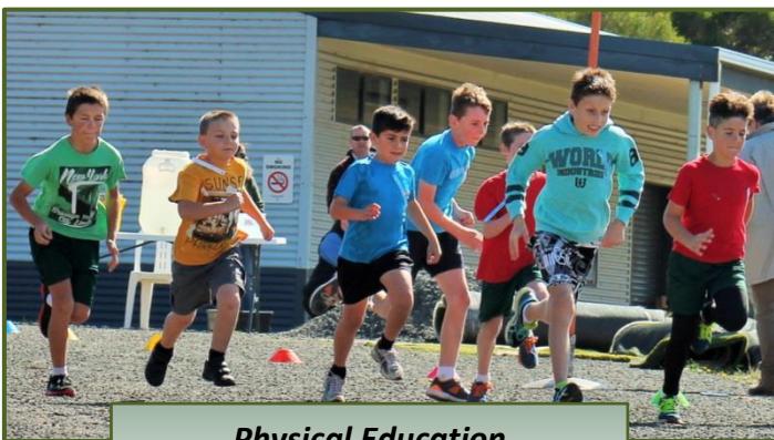
Physical Education Enthusiastic and active