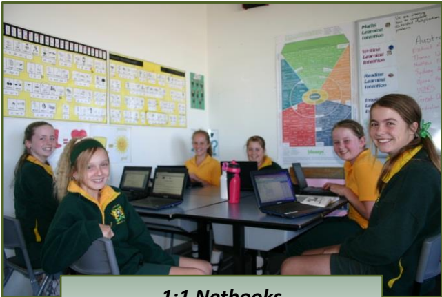
1:1 Netbooks Education anywhere, anytime