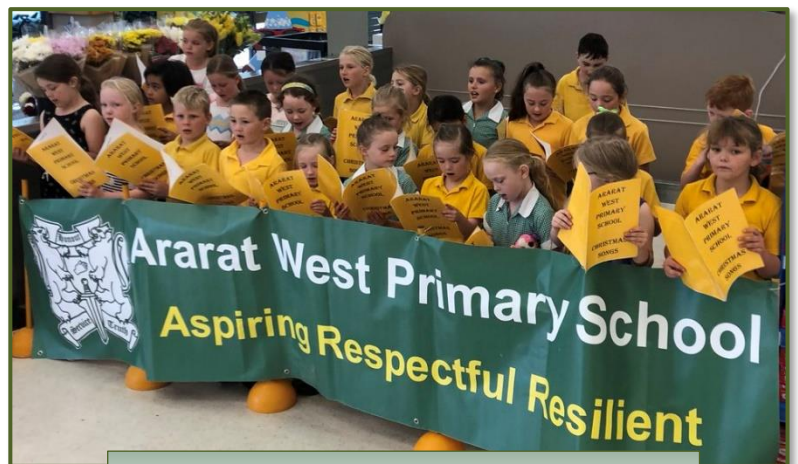
Music and Performing Arts Program