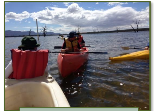
Gr3 Roses Gap Camp

All children can expect to take part in overnight camps and tours. These camps and tours are approved by the School Council and the Office of Emergency Management (Department of Education). Parents are kept well informed of these activities.